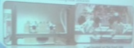
1 set located on the top side